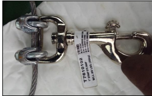
Hoisting wire is 3/32-inch 7 x 9 steel cable

Coating is commercial-grade handrail paint designed to resist chipping. Paint color can be determined by the city.