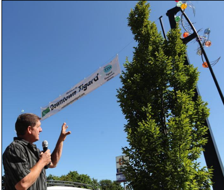
Tigard chose a glass design involving collaboration with a local glass artist