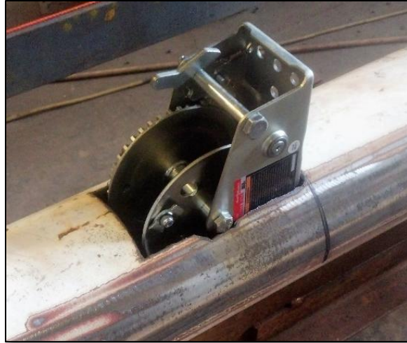
Hoisting winch has a 1500-pound linear pull capacity