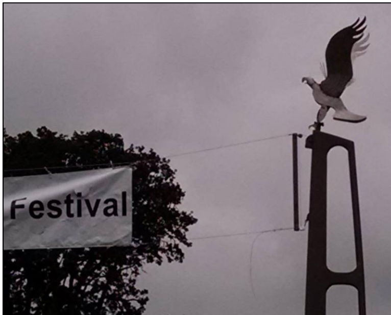
Estacada chose an eagle on one pole and an osprey on the other