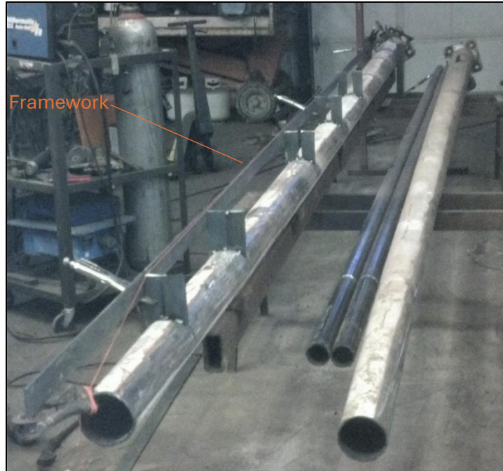
Construction of framework over pole to create airplane wing-like shape

The backstay for each pole is constructed of 2-1/2-inch diameter Schedule 40 black iron pipe. The first five-feet at the top of the backstay is integrated into the framework to create a safety pin-like shape.