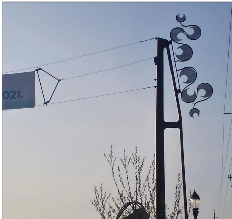
Oregon City chose a whimsical abstract design