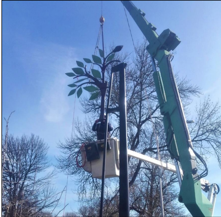
Forest Grove chose a tree-themed design to mirror their town logo