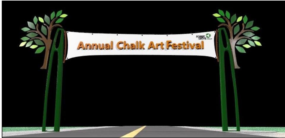
Sample Rendering of Banner Pole System