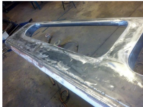
Construction of backstay to create safety pin-like clasp shape at top of each pole

The base is constructed from 1/2-inch plate. Bolts are 3/4-inch and embedded in the concrete to a minimum depth of 10-inches. The concrete foundation needs to be a minimum of 4-foot square. All hardware is marine grade stainless steel for weatherproofing and longevity. The hoisting wire is 3/32-inch, 7 x 9 steel cable. The winches are 1500 lbs.