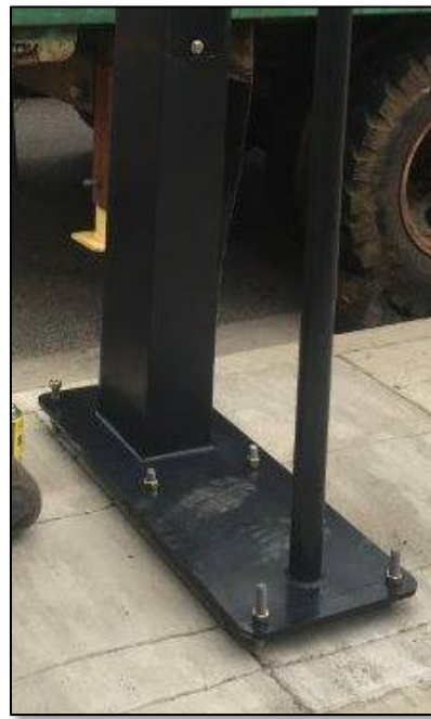
Base Plate photos and drawings