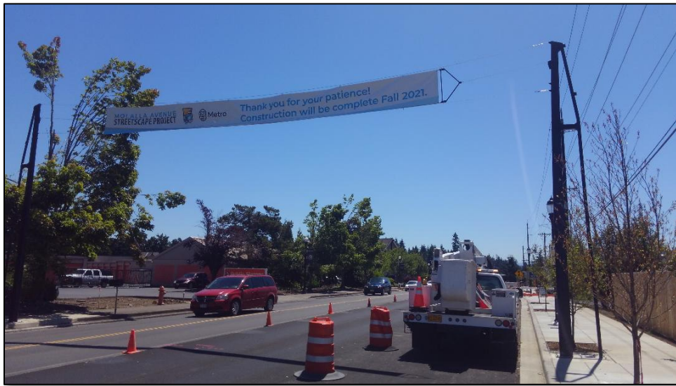
Oregon City, Oregon