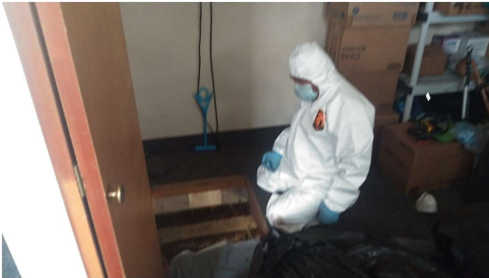
Left, a contractor working for the City enters the crawlspace at the Molalla Adult Center to begin removing water-damaged insulation. This work ended up being covered by insurance.