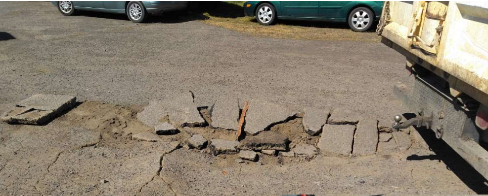
A traffic accident on Section St (left) caused large holes in the asphalt in April. City Crews did their best to patch the road (below).