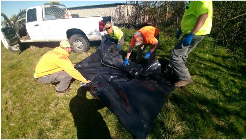
Left, City crews roll a deer up for disposal in early May. The animal was hit by a vehicle and euthanized by Molalla Police. While the City would like to see all Street Funds go directly to repairing roads, carcass cleanup is part of the services the City must provide - and an ongoing expense to the Street Fund.