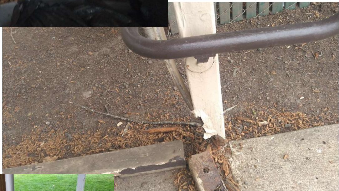
The Molalla Adult Center is an old building and requires maintenance and care. For example, shown right (a “before” picture), a load bearing column on the Adult Center’s awning deteriorated, and was replaced by the Utility crew in mid-May (“after” picture, below).