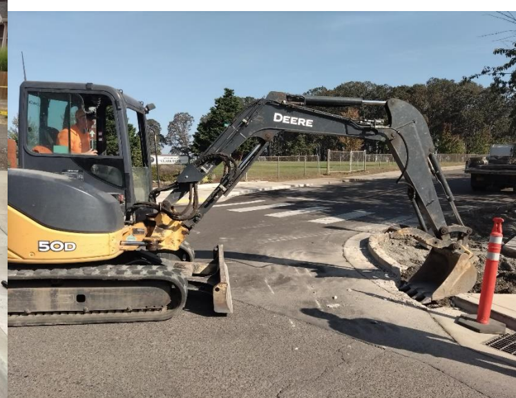
Below: Crews Continue to Rework the Shirley & N. Cole Intersection

Utility Crew Hand Dug the Channel Out of Storm Ditch